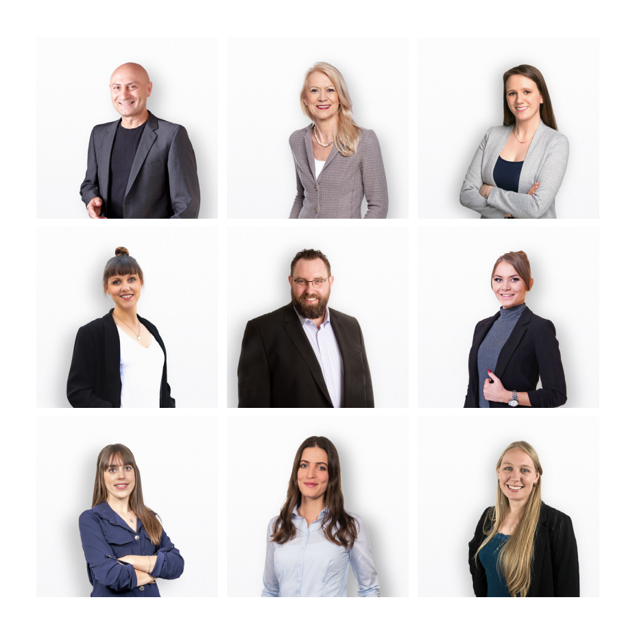
The alfaview team will gladly help you at any time!

Furthermore, we are always striving to further improve our services and very much appreciate your feedback!